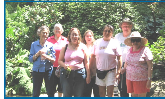
Hillside Manor Walking Club

Self-Sufficiency Service Coordination helps improve living conditions and enables residents to age-in-place. Services include: