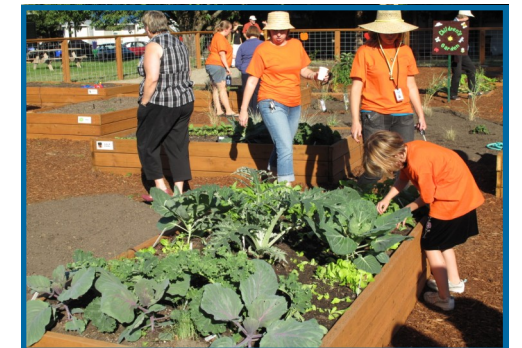
Community Gardens in Milwaukie and Oregon City Public Housing Developments.